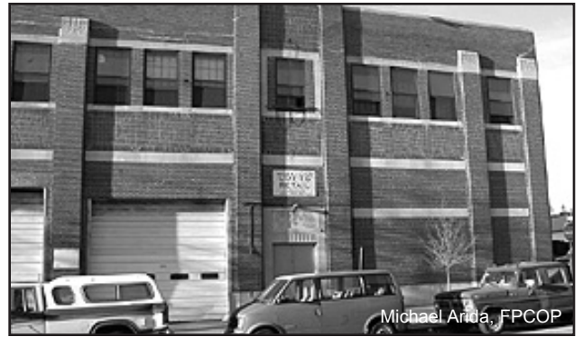
The facade, with loading docks instead of windows, offers charm but challenges for reuse.

FPCOP Newsletters are online @ www.fpcop.com