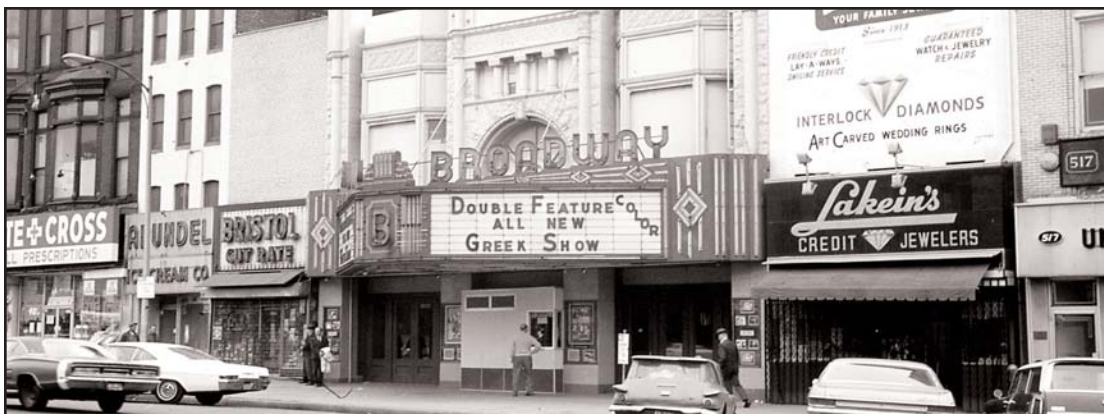
In 1968, Latin Palace was still Broadway Theater, its neighbor was Lakein's, and at the corner was a drug store

Nothing Pale at Ale Mary's: A new bar is settling in at Washington and Fleet Sts.: Ale Mary's--"Food, Fine Wine and Heavenly Ales."