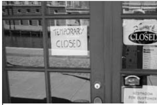
AFTER LEAVING a sushi favorite at Arm Street Wharf in recent years, Kawasaki Cafe was raided March 2 by Immigration agents who arrested owners and detained 15 alleged illegal immigrants at three linked restaurants.

An attempt to expand the "Gentlemen's Club"